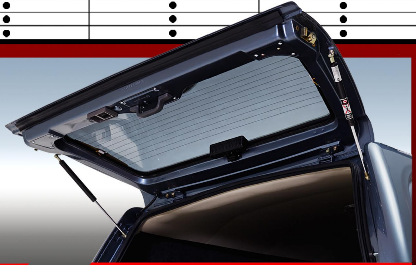
REAR GLASS MOUNTED ON 0.8 MM GALVANISED STEEL FRAME