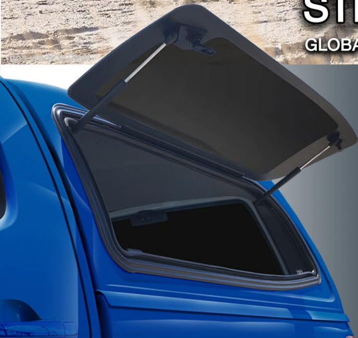
Electric Bird Wing

GLOBAL SUPPLIER OF STEEL CANOPIES & 4X4 CANOPIES