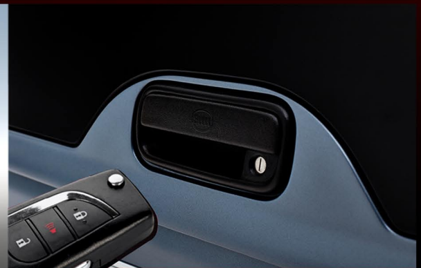
REMOTE CONTROL DOUBLE ROTARY DOOR LOCKS