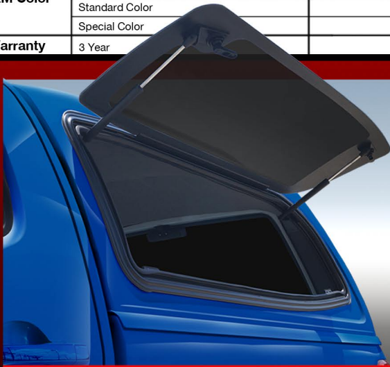
HIGHER WINDOW CROSSSECTIONAL AREA