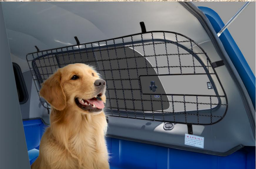
Animal Welfare Canopy